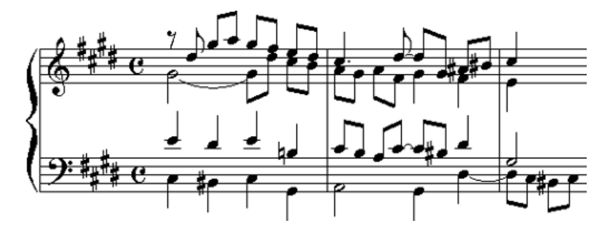
Here the alto goes into eighth notes after the soprano has already started them and continues after the soprano has stopped. The bass and tenor start off together in quarter notes but change in measure 2 to different values. This the texture remains transparent, but no two lines ever go for long in rhythmic unison.