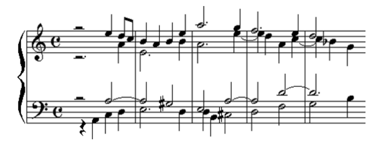
Here the accidentals announcing D minor, C# and Bb, are both treated as suspension resolutions. The suspension attracts the listener's ear, and the fact that the newly altered note acts as a resolution makes its arrival particularly smooth.

Most explanations of modulation focus on pivot chords. However the way newly altered tones are approached melodically is at least as - if not more - important in making a modulation convincing to the ear. Alterations create novelty. There is always one line introducing each alteration. (Otherwise the altered note would be doubled, creating harshness as well as a weak resolution.) If the modulation is not to seem confused, this line must be in the foreground. This means avoiding distracting motivic or harmonic events elsewhere, and giving the new accidental at least some rhythmic weight. The composer must draw the listener's ear to the active notes in the modulation . One excellent way to do this is to make the new alteration the resolution of a suspension.