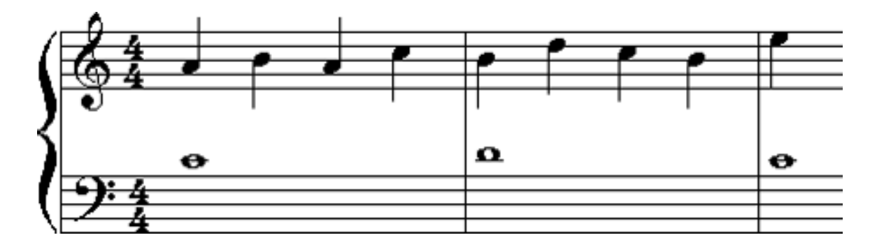
In most species approaches, the octaves created between the C in the first bar and the D in the second would be prohibited as being too close. However they are not really disturbing, because the motives in the two bars do not correspond, mitigating any tendency for the ear to associate these notes.

* most cases of parallel 5ths and 8ves (Incidentally, certain parallel 5ths and 8ves that are prohibited in conventional species counterpoint are quite innocuous, even unnoticeable. Once past the earliest stages, instead of blanket prohibitions, it is more useful to discuss why certain cases are disturbing and others not. Such discussions help the student refine his hearing.)