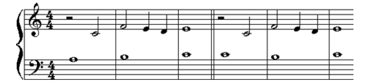
In the first example, the similar motion of soprano and bass creates a very strong accent on the seventh in bar 2. In the second example, this accent is somewhat weakened by the contrary motion of the bass.

* approaching dissonances in similar motion, especially in outer parts. This is especially flagrant when they leap.