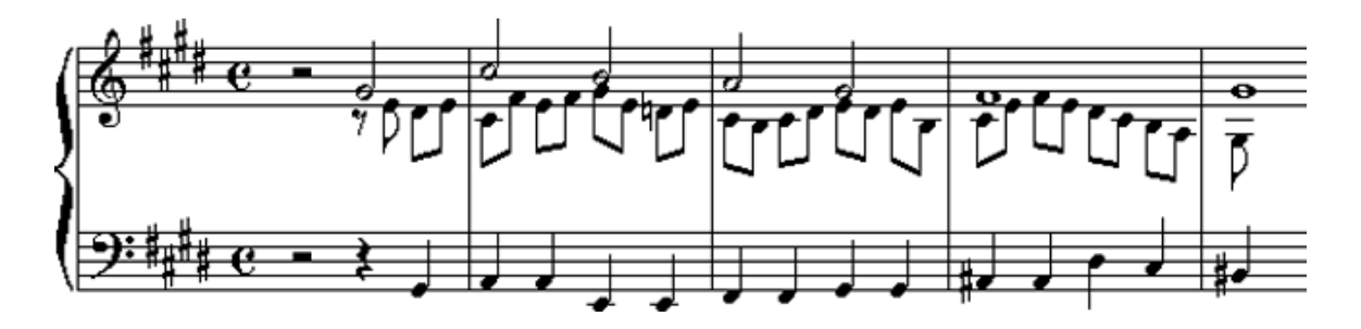
In this (instrumental) example, the soprano presents the chorale melody in long notes, the alto uses a neighbor note motive, and the bass emphasizes repeated notes. (Incidentally, note how the alto and bass deviate slightly from their respective motives at the cadence. This is typical, and contributes to setting the cadence apart from the rest of the phrase. Schoenberg calls this process "liquidation", a rather oppressive term!)

To return to the issue of linear independence, it may be measured in two (not entirely mutually exclusive) ways. First, independence may result from the motives used.