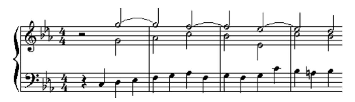
In this example, typical of a mixed species exercise, each part has its own rhythm. The "liberties" at the end (the change of chord on the last beat of bar 3, and the accented passing tone on the beat f bar 4) are musically fluent and logical, and should not be prohibited. Rather they should be explained to the student.

This issue of the degree of similarity between strands in a contrapuntal texture leads us to a new concept here: the notion of musical "planes". A plane is defined as a musical strand, consisting of one or more parts , which is highly unified in its material. The number of planes and the number of real parts (or "voices") do not necessarily correspond . For example, in Ach wie nichtig, ach wie flûchtig , from Bach's Orgelbuchlein , the top part contains the chorale melody in long values, while the two middle parts imitate each using a scale motif in 16th notes, and the bass in the pedals is organized around another motive entirely. In this case, we have three rhythmic and timbral planes made up from four parts. This kind of writing is very typical. To take our social analogy farther, planes can act like subsidiary groups within a community. In the case of a plane consisting of only one part, the relevant analogy would be the individual versus the group.