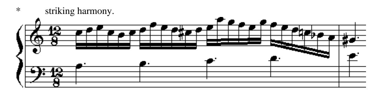
In this example, after a melodic peak on the high A after the third beat, the Neapolitan harmony on the last beat creates a harmonic accent.

One of the most important aspects of linear independence is independence of accent. Even when all lines use the same note values, they will not normally have entirely coordinated accents. Coordinated accents are a strong sign to the listener that something special is happening, usually a climax. When previously independent strands begin to follow the same contour at the same time, the effect is one of simplification, clarifying momentum for the listener and increases the music's drive. Used well, this is a powerful cue that culmination is approaching; used badly, it destroys tension: If the expected climax does not materialize, the effect can be disappointing.