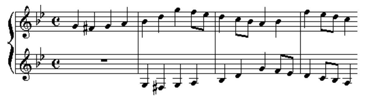
Notice how the A — accented neighbor note — in m. 3, becomes a chord tone in measure 4.

* Adding a free part, most often in the bass. In effect, this is a way of making the first two solutions more easily audible.