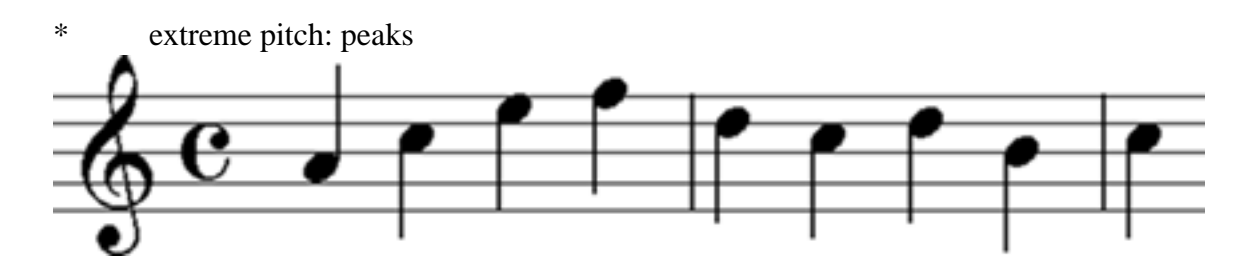
Here the high F, despite its weak metrical position, would be sung with a certain intensity, mitigating metrical squareness.