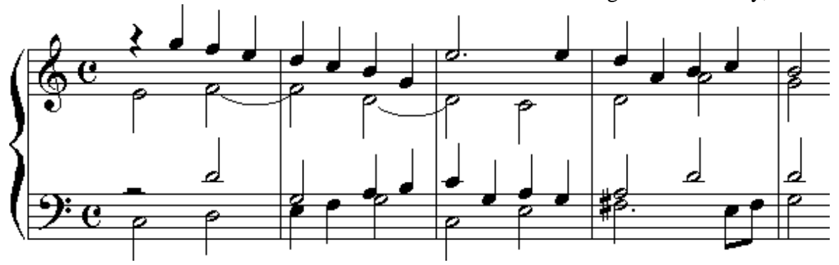
* the relative number of chord and non-chord tones sounding simultaneously,