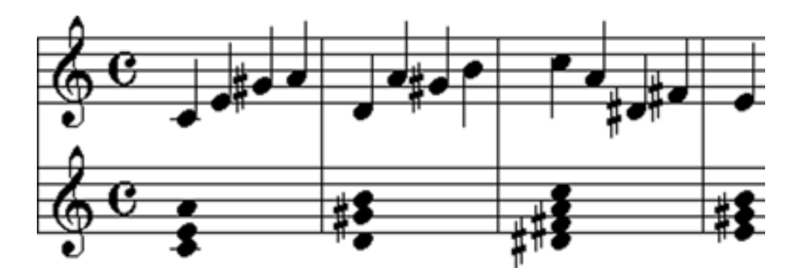
Here the melody implies voice leading of 3-4 parts, as portrayed on the lower staff. Note that active notes are resolved normally in the next harmony. Unresolved active tones would create distraction.

In "compound line", a melody is enriched by frequent leaping between two or three substrands, giving the illusion of two or three simultaneous levels, although there is actually never more than one note sounding at a time.